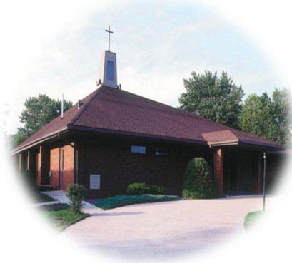
St. Mary Farmersville

310 Noble Street Farmersville, Illinois 62533 217-227-3349