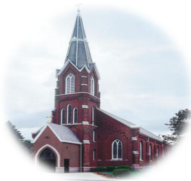
St. Maurice Morrisonville 706 E. Fourth Street (P.O. Box # 45) Morrisonville, Illinois 62546 217-526-3363

310 Noble Street Farmersville, Illinois 62533 217-227-3349