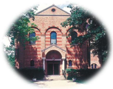
St. Raymond Raymond 306 S. McElroy Street Raymond, Illinois 62560 217-229-4435