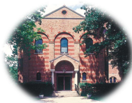
St. Raymond Raymond 306 S. McElroy Street Raymond, Illinois 62560 217-229-4435