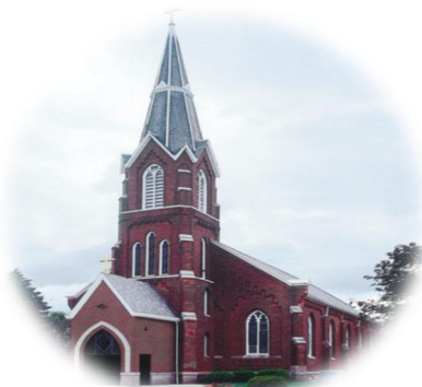
St. Maurice Morrisonville 706 E. Fourth Street (P.O. Box # 45) Morrisonville, Illinois 62546 217-526-3363

310 Noble Street Farmersville, Illinois 62533 217-227-3349