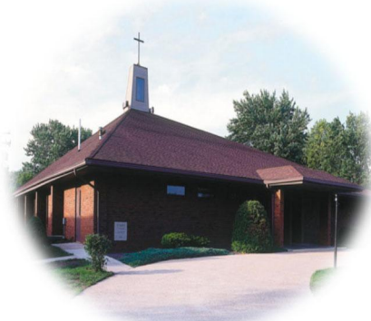
St. Mary Farmersville

310 Noble Street Farmersville, Illinois 62533 217-227-3349