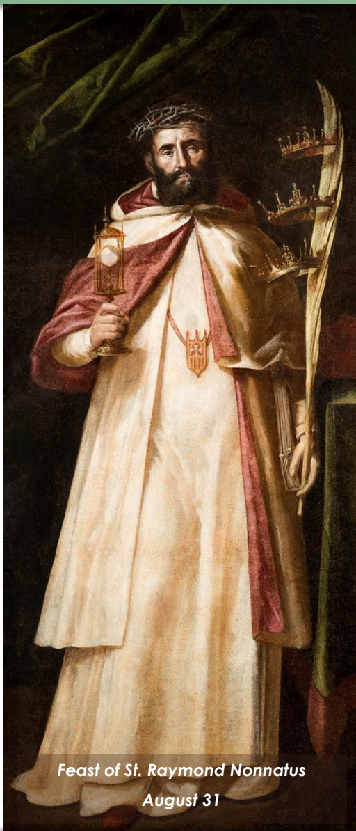
Feast of St. Raymond Nonnatus August 31