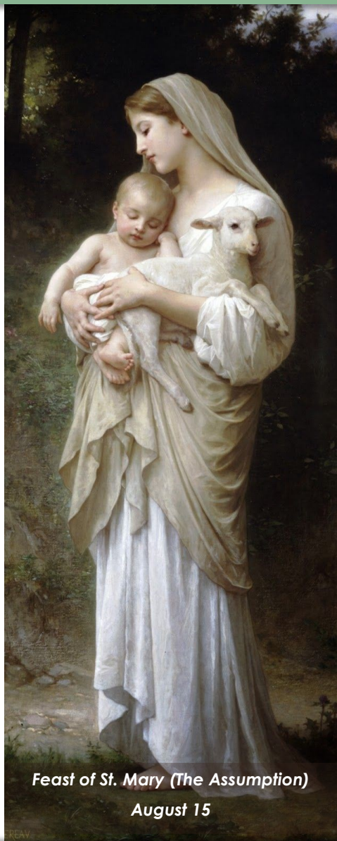
Feast of St. Mary (The Assumption) August 15