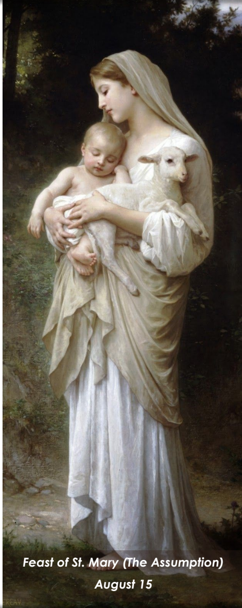
Feast of St. Mary (The Assumption) August 15