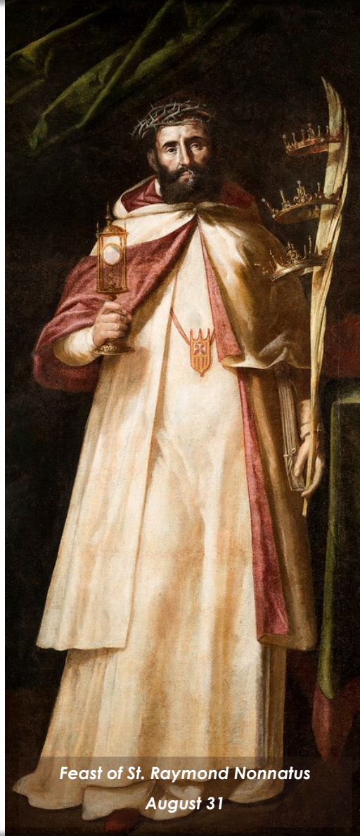
Feast of St. Raymond Nonnatus August 31