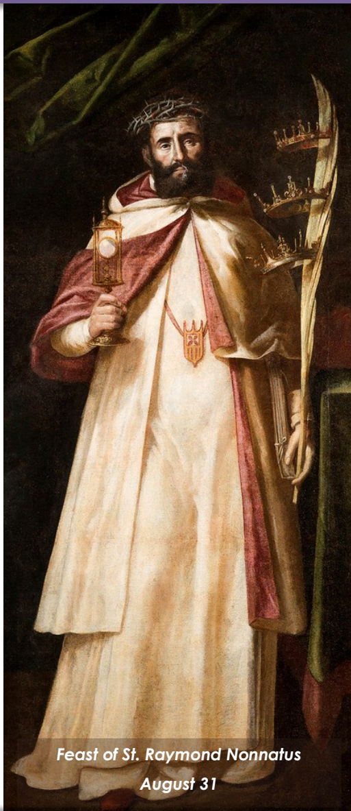
Feast of St. Raymond Nonnatus August 31