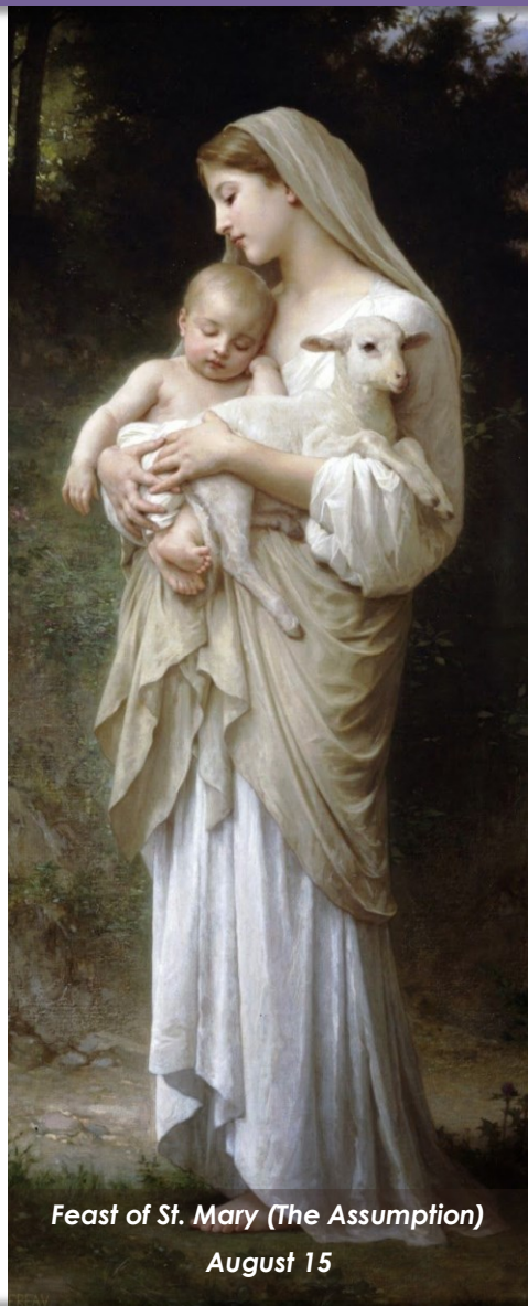
Feast of St. Mary (The Assumption) August 15