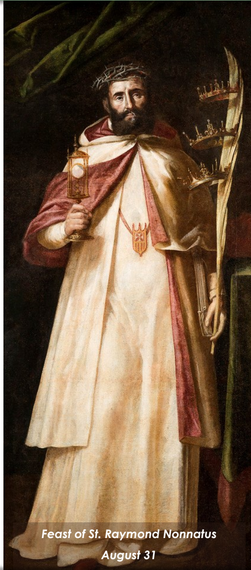
Feast of St. Raymond Nonnatus August 31