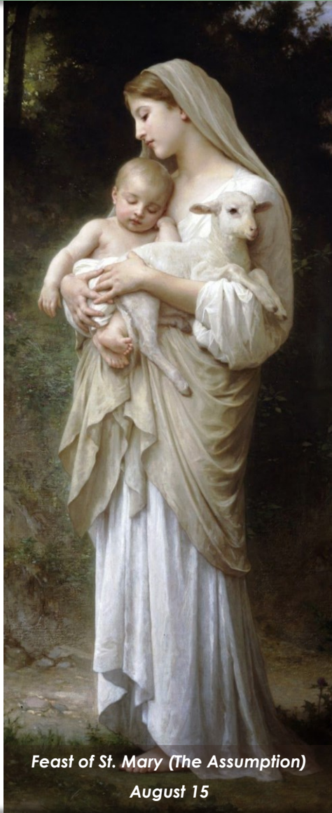
Feast of St. Mary (The Assumption) August 15