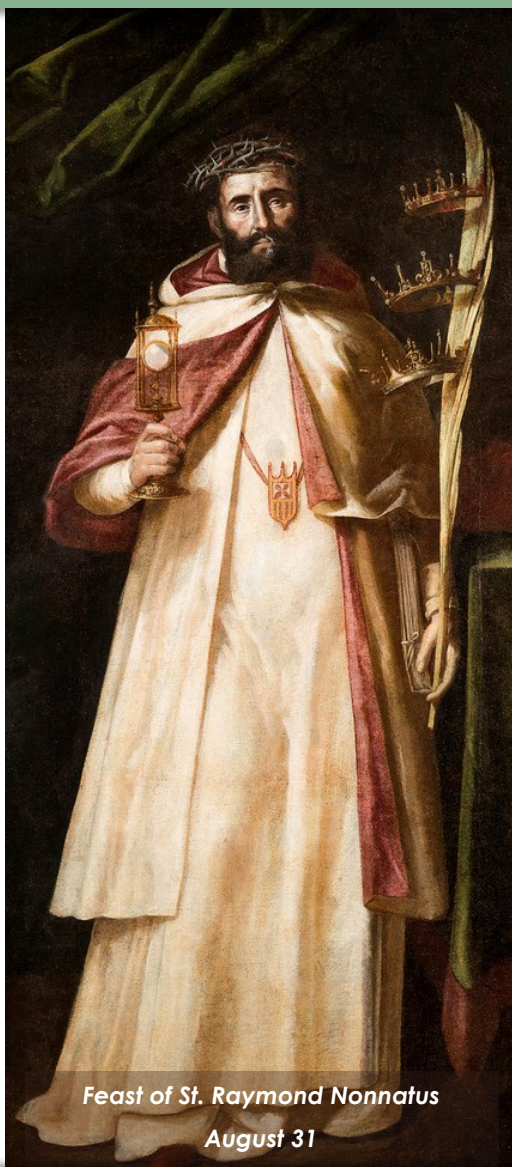
Feast of St. Raymond Nonnatus August 31