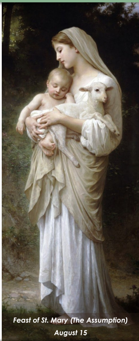
Feast of St. Mary (The Assumption) August 15